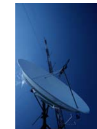
Information is obtained electronically from the selected vendor.

The reporting capabilities of the InvoiceCheck® program allows for customized reports as well as over 70 built-in reports. Operations personnel can have read-only access to obtain important statistical and quantitative information. Reports are also Web-accessible.