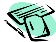
Vendor payments are created from your accounting system.